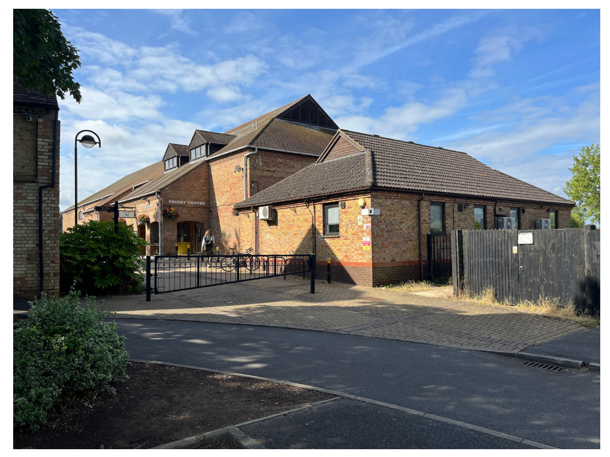
Illustration of The Priory Centre from St Anselm Car Park